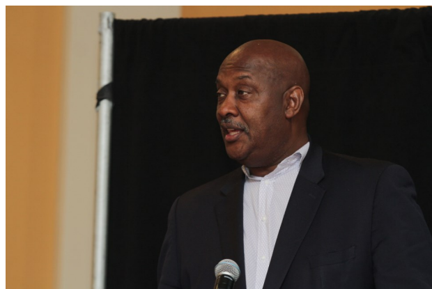
Pennsylvania Congressman Dwight Evans (PA-03) speaks at Penn VUB's 2018