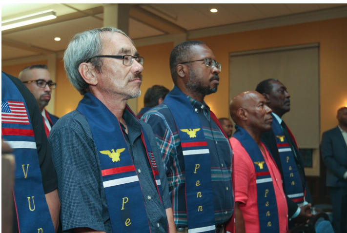
Recent graduates of Penn VUB's college readiness program will receive a certificate of completion honoring their hard work.

This fall the graduates head off to regional colleges including Chestnut Hill College, Stockton College, LaSalle University, and the Community College of Philadelphia. Penn VUB reports that the success rate for its graduates is high—most go on to enroll in postsecondary courses. The program teaches important academic skills that help make this possible but, perhaps more importantly, it builds confidence in the veterans' own abilities.