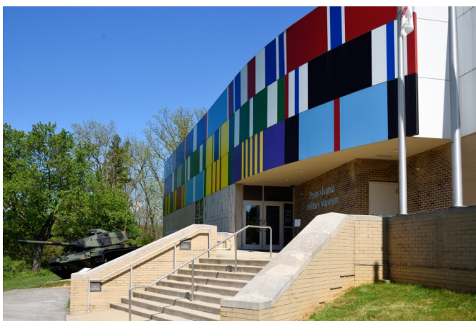
The Pennsylvania Military Museum in Boalsburg

This past summer, 93 of Pennsylvania's museums, including all of the museums operated by the Pennsylvania Historical and Museum Commission (PHMC), participated as Blue Star Museums. Blue Star Museums is a collaboration among the National Endowment for the Arts, Blue Star Families, the Department of Defense, and museums across