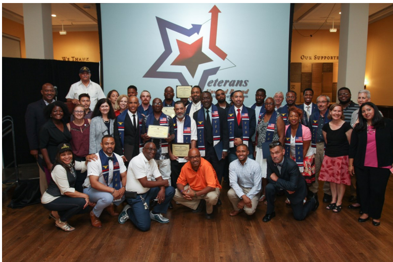
Penn VUB graduates gather for a group photo at the 2018 graduation ceremony.